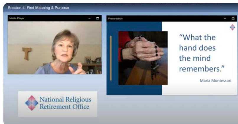
Excerpt from the Walking Together video series.