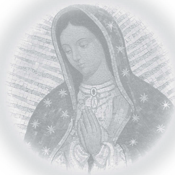
Image: A mosaic of Our Lady of Guadalupe decorates a side altar in the Church of Santa Maria della Famiglia at the Vatican. Dec. 15. NABRE © 2010 CCD. Used with permission. Copyright © 2015, United States Conference of Catholic Bishops, Washington, DC. All rights reserved.

*Full URL: http://www.usccb.org/about/pro-life-activities/respect-life-program/2013/life-matters-a-catholic-response-to-the-death-penalty.cfm