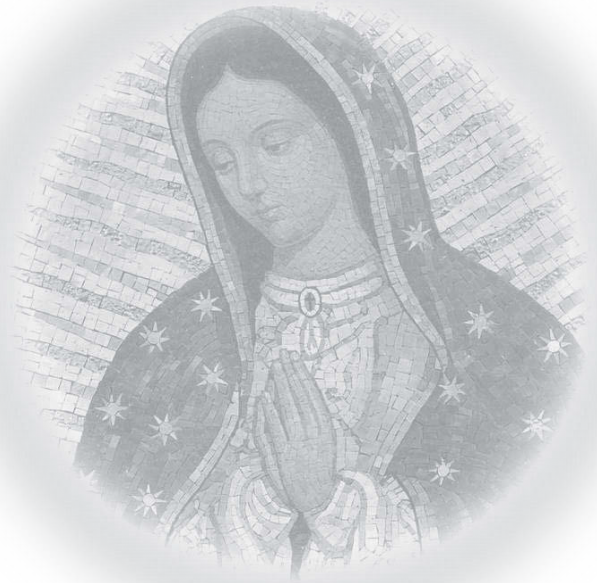
Image: A mosaic of Our Lady of Guadalupe decorates a side altar in the Church of Santa Maria della Famiglia at the Vatican. Dec. 15. (CNS photo/Paul Haring). Copyright © 2015, United States Conference of Catholic Bishops, Washington, DC. All rights reserved.

*Full URL: http://www.usccb.org/about/pro-life-activities/respect-life-program/2012/life-matters-pornography-and-our-call-to-love.cfm